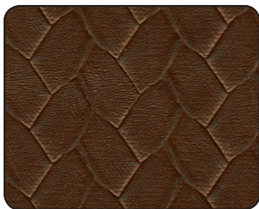
SSR - 005 Pinecone