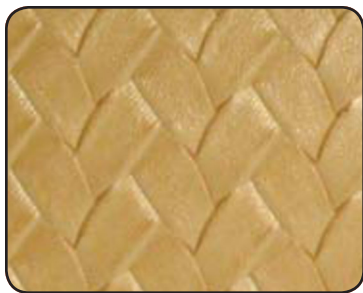
SSR - 008 Reed