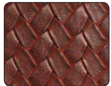
SSR - 006 Pomegranate