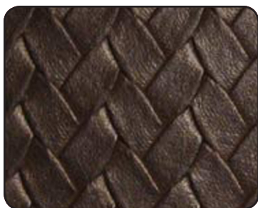
SSR - 009 Truffle