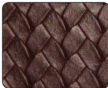
SSR - 004 Madeira