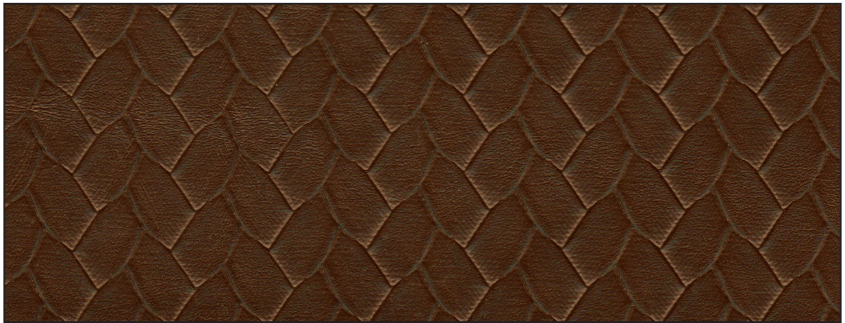
SSR - 005 Pinecone