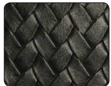
SSR - 003 Eclipse