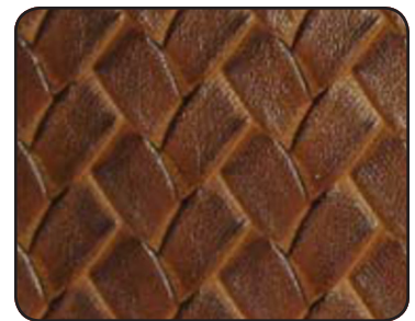
SSR - 001 Bourbon