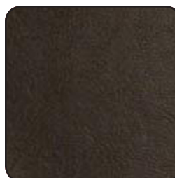
SVI-009 Old Country