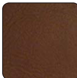
SVI-005 English Toffee