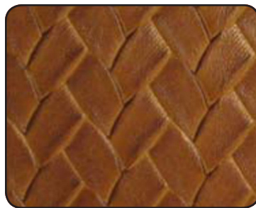
SSR - 002 Cognac