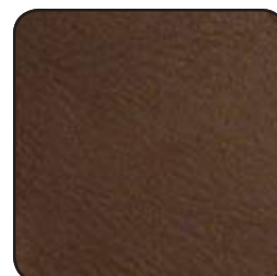
SVI-008 Old Bronze